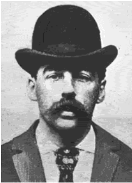
Serial killer H.H. Holmes